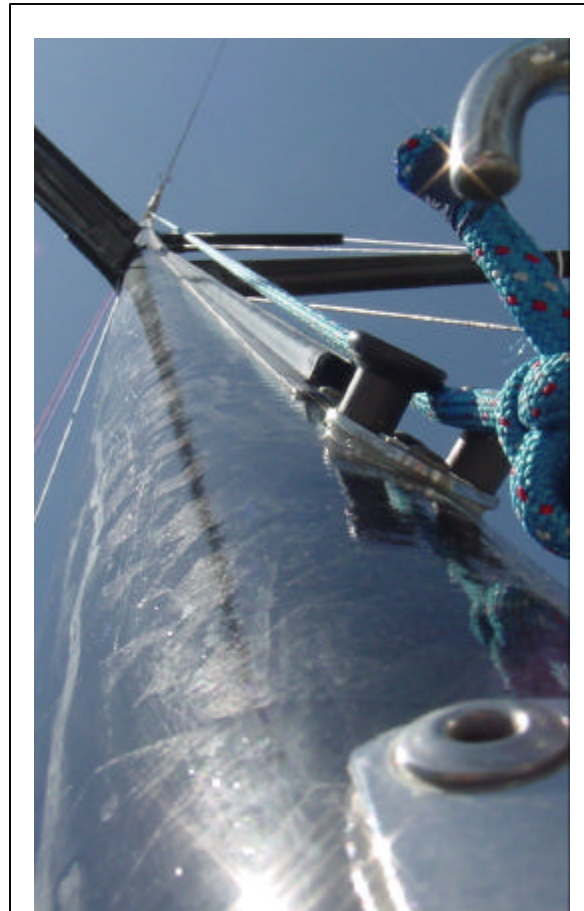
Reference photo of pre-bend set up to listed specifications. Note very straight section from mid-mast down.

Jib: Lead at Medium setting; increase halyard tension to keep draft forward and round entry.